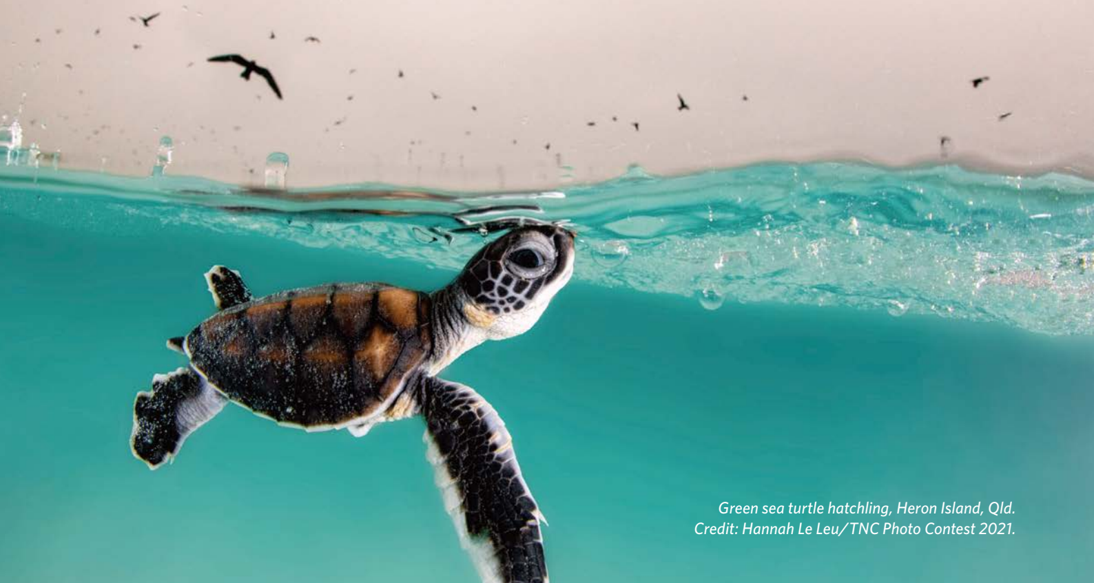
Green sea turtle hatchling, Heron Island, Qld.