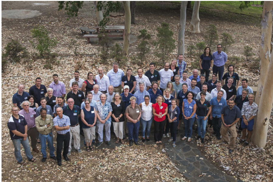
Figure 1. The inaugural Coastal Restoration Symposium attendees. IColour figure can be viewed at wileyonlinelibrary.com

and (ii) restoration research. Both themes provided opportunities for 15-minute presentations and 5-minute speed talks. The overall symposium atmosphere was informal and low-key, with lots of long breaks to encourage discussion and the development of collaborative partnerships. In response to rising costs of conferences (even domestic conferences are starting to cost close to AU$1,000) to attend that often prohibit student and public sector attendance, costs were kept down to $100 per attendee or $50 for students. This was achieved by not hiring a conference organiser, having no giveaways, taking advantage of free facilities at JCU and opting for inexpensive mainstream catering options such as pizza and sushi. The organisation of the symposium was also kept informal, and an 'invitation-only' format was primarily selected with the view that 'founding members' would help gauge the need, direction and future format of the Network and symposia.